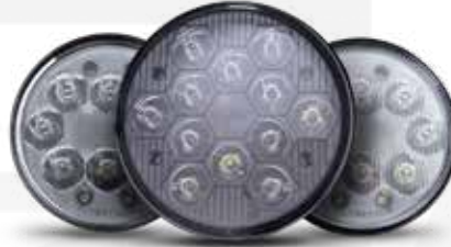
Purchase WAT PARMETHEUS™ G3 LED