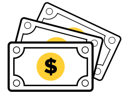
Receive a CASH REBATE up to $70

*The TRADE-IN | TRADE-UP Rebate Offer is for new PARMETHEUS™ G3 SERIES purchases only.