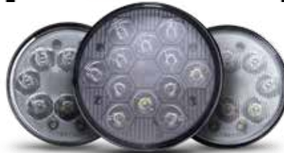
Purchase WAT PARMETHEUS™ G3 LED