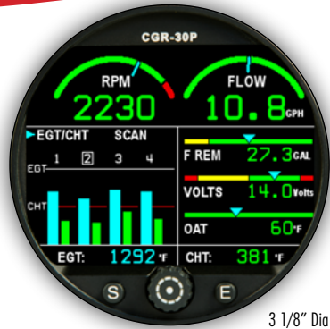
3 1/8" Dia