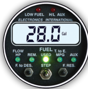
2 1/4" Dia