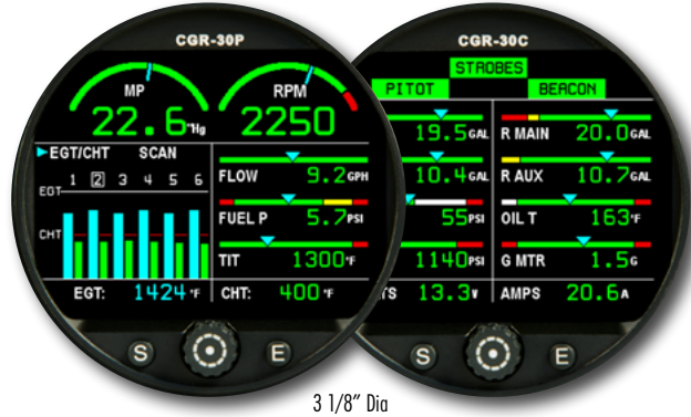
3 1/8" Dia