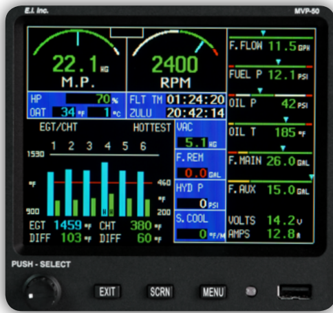
5.52" x 5.16"