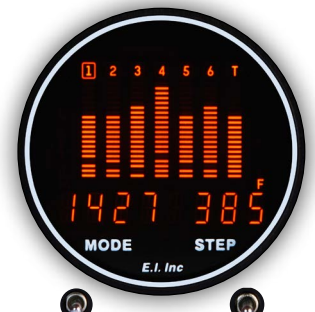
2 1/4" Dia

Primary Replacement (STC'd/TSO'd) 4-CYL $600/6-CYL $800