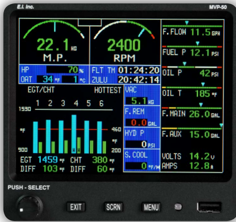
5.52" x 5.16"