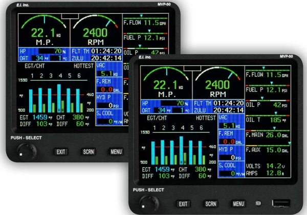
5.52" x 5.16"

CGR-30P Twin Pkg Primary Replacement (STC'd/TSO'd) 4-CYL $1,000 6-CYL $1,200