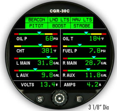
3 1/8" Dia