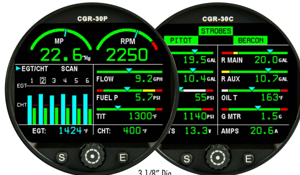
3 1/8" Dia