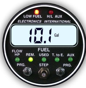
2 1/4" Dia