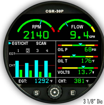
3 1/8" Dia