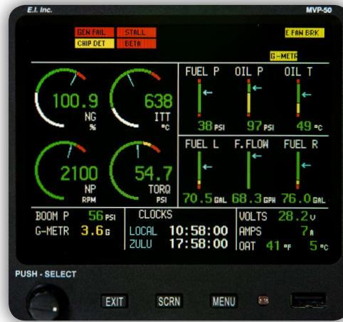
5.52" x 5.16"

Primary Replacement (STC'd/TSO'd) 4-CYL $300/6-CYL $400