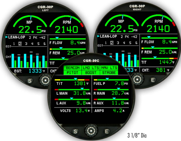
3 1/8" Dia

CGR-30P Twin Pkg Primary Replacement (STC'd/TSO'd) 4-CYL $1,000 6-CYL $1,200